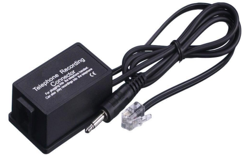
Call Recorder hardware Compact, Discreet, Easy to Install

Like all Papillon Technology computer telephony products, Call Recorder is seamlessly integrated with HEAT®, making it straightforward and easy to use.